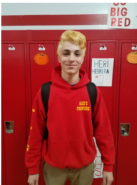
Wrestling Team bleach their hair for "wrestling awareness month"