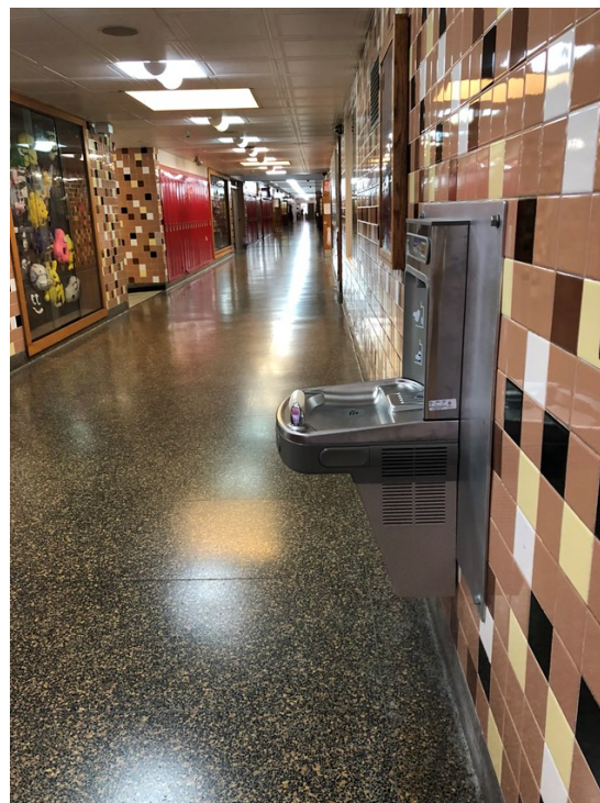
New water fountain in senior hallway looking to break some senior hips

When pressed for comments, the teens rolled their eyes without breaking eye contact with their screens.