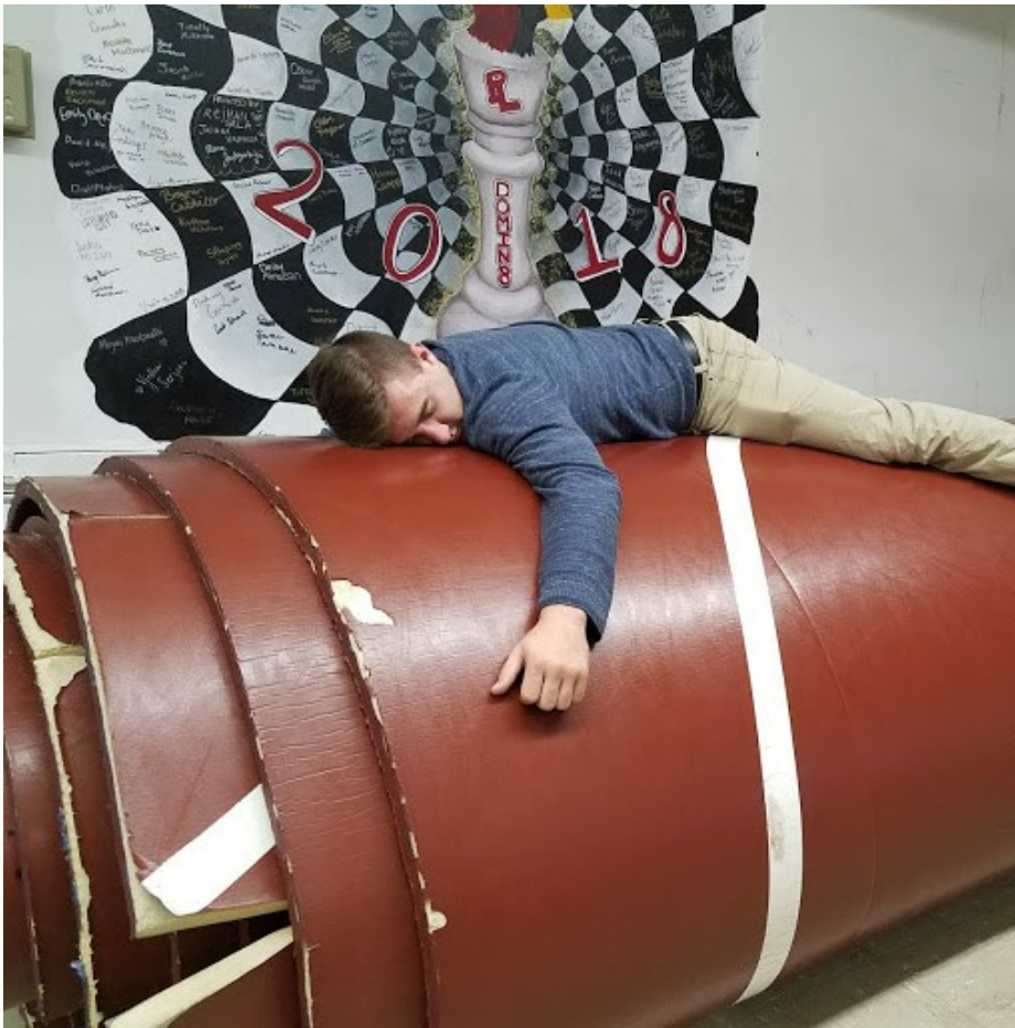
Student exhaustion deemed “Checkmate” by upperclassmen

The struggle is real when it comes to facing grossly incompetent customers in retail. The minimum pay for a retail associate is too low considering what they do is never enough. Whether it being folding clothes after an annoying customer comes and wrecks the pile, annoying customer coming in right before closing time, annoying customers who think that employees actually care about their needs, and the list goes on and on.