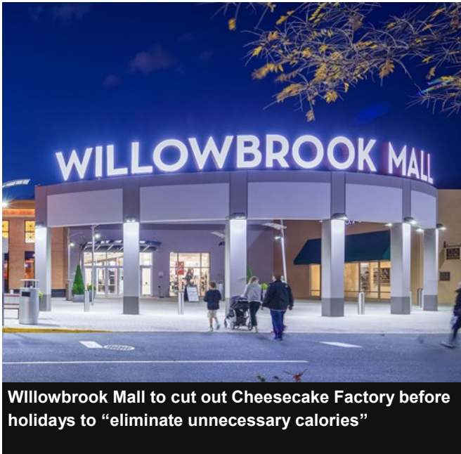
Willowbrook Mall to cut out Cheesecake Factory before holidays to “eliminate unnecessary calories”