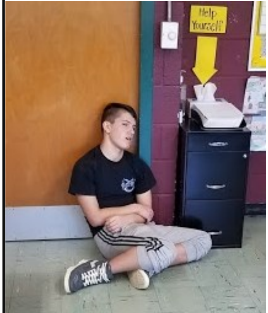
Student in sarcastic shock coma after finding tissues available during allergy season

The United Airlines flight took off shortly after with no passengers on board.