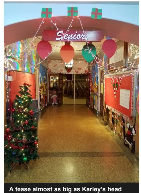
A tease almost as big as Karley’s head

In a town where pride and tradition have been infused into the heads of all students by the time they were three, these students are taking a heroic stand on one of the few traditions they have left. Their hopes are that the PLPD removes the barricade and they can party freely once more.