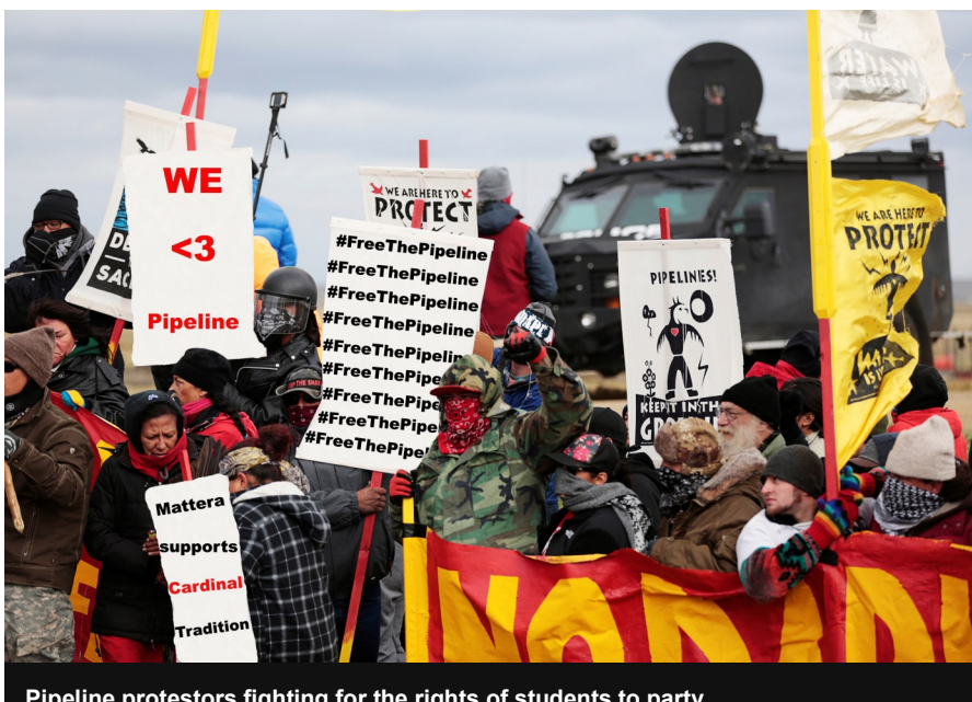
Pipeline protestors fighting for the rights of students to party

New York University - On college campuses in America, college millennials are creating “safe” spaces through bullying everybody with whom they disagree. New York University has announced that safe spaces will be created for students who feel uncomfortable in the company of anyone who voted for Trump, (cont. on page 4)