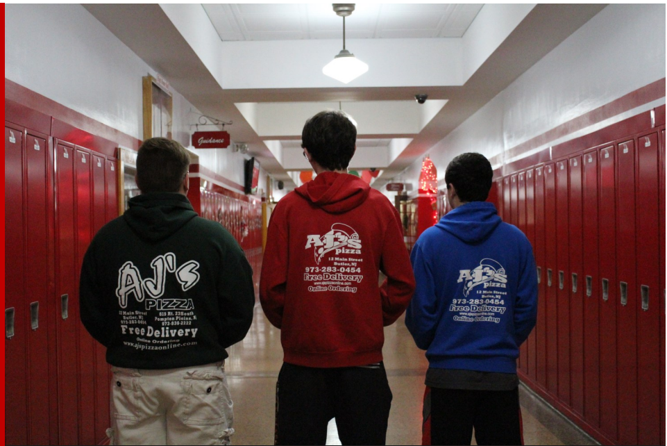
AJ's pizza employees strut. Read a full review at thenestreview.wordpress.com