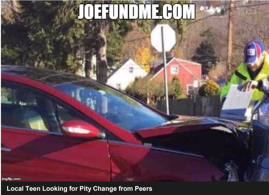
Local Teen Looking for Pity Change from Peers