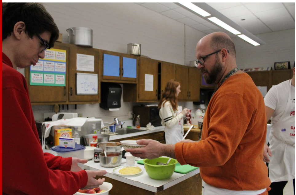
Impoverished senior, Shkumbin, receives a meal from the PLHS soup kitchen

Regardless of what anyone says, for now the students are going to fight until they get what they want. They believe they sat around for too long, unnecessarily paying for something until they are out of money. They will not give up any time soon.